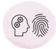
Thinking & Reality