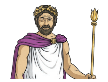
King Philip II takes control of Greece.