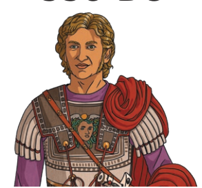
Alexander the Great takes control of Greece.