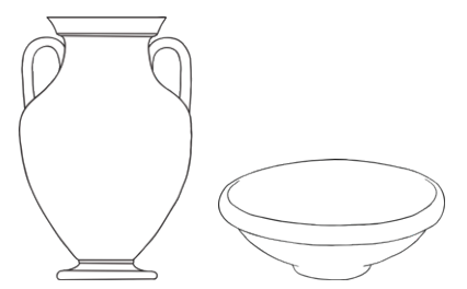
Around this date, the Classical period starts.