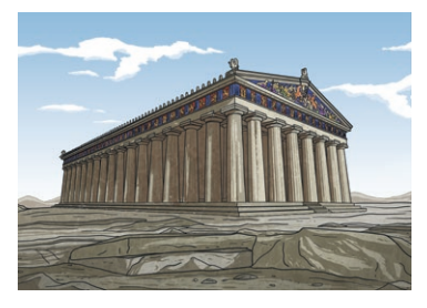
The Parthenon is finished in Athens.