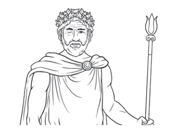
King Philip II takes control of Greece.