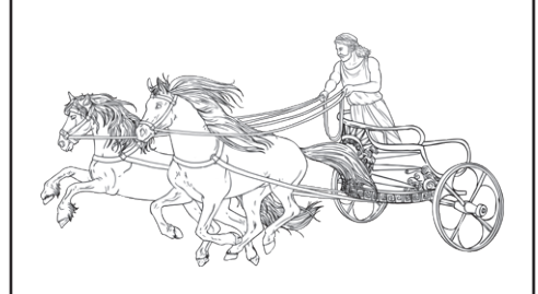
First Olympic Games are held.