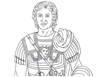
Alexander the Great takes control of Greece.