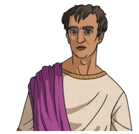
Male citizens of Athens are allowed to vote.