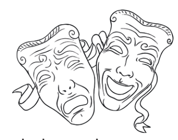
Greek theatre becomes popular in Athens.