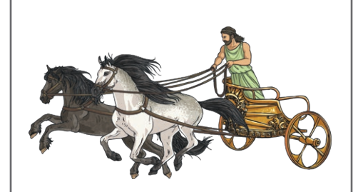
First Olympic Games are held.